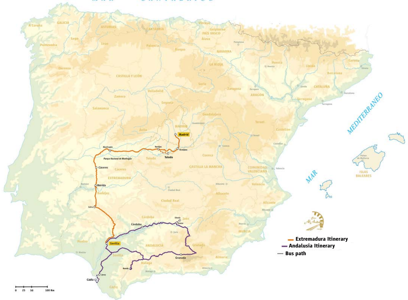
— Extremadura Itinerary — Andalusia Itinerary ..... Bus path

Step on board the Al Andalus and discover why this palace on wheels is considered the most spacious and luxurious tourist train in the world.