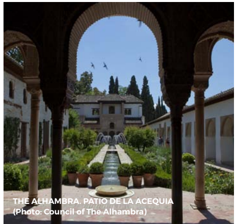
THE ALHAMBRA. PATIO DE LA ACEQUIA