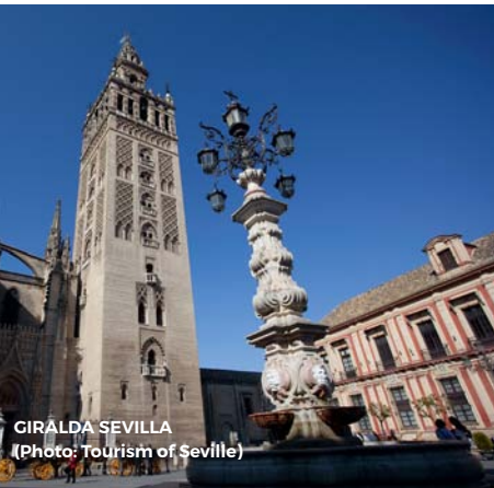
GIRALDA SEVILLA